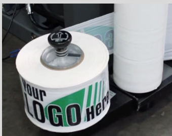
Optional: Adaptor for printed film

Semi-automatic, low-profile pallet wrap machine without pre-stretch carriage. Manually applied braking system applies stretch up to 20%