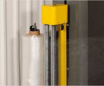
“Quick Thread” simplified stretch film carriage.