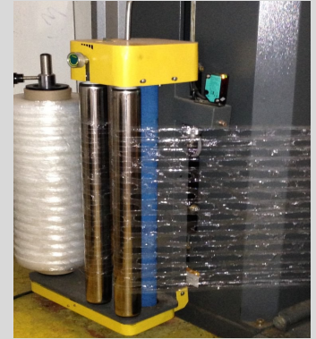
AirFlow™ Vented Stretch Film