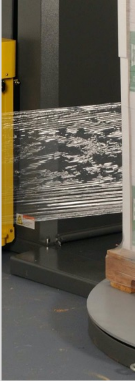
Hi Perform Stretch Film