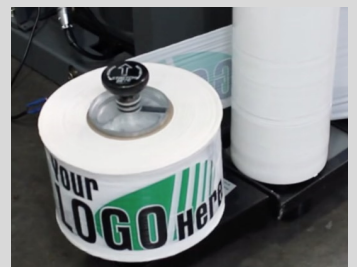
Optional: Adaptor for printed film