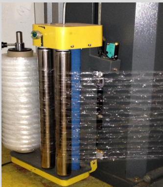
AirFlow™ Vented Stretch Film