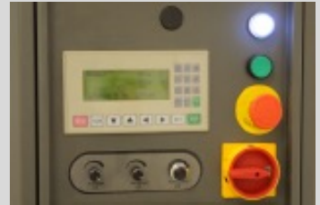
Simple to operate LCD screen