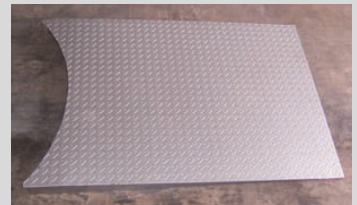
Optional: Steel ramp for pallet jack loading